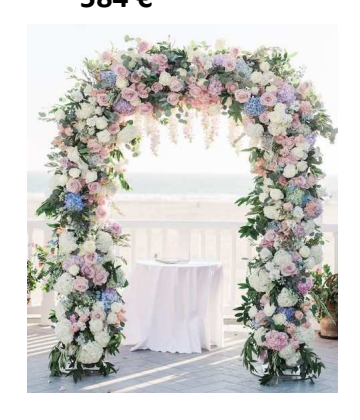
Beach Arch Decoration Style 2 584 €