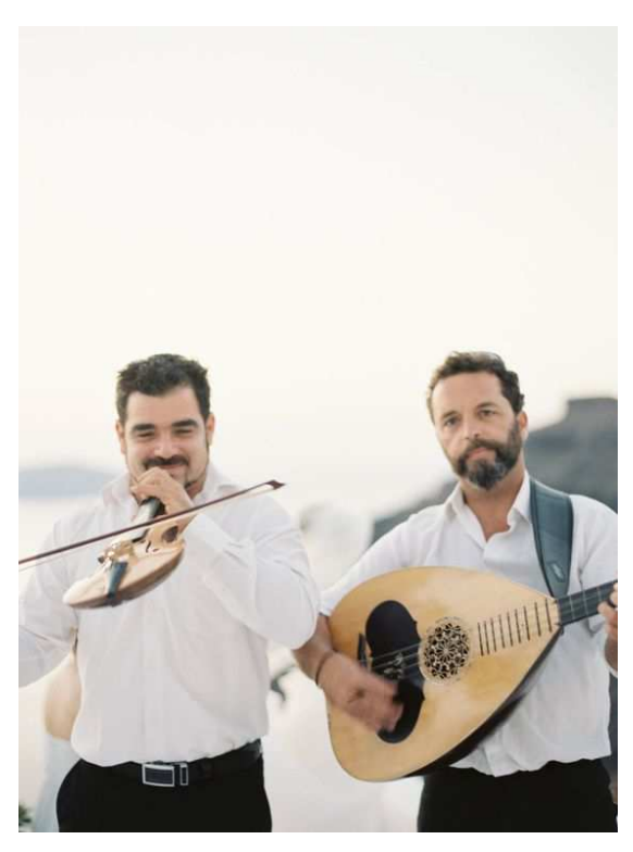
Bridal Band 210€