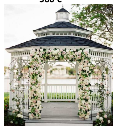
Gazebo/Chapel Decoration Style 2 560 €