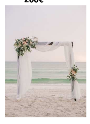
Beach Arch Decoration Style 1 200€